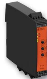
1-phase smart motorstarter UG 9411

Standard type: UG 9411PM AC 230 V 50/60 Hz 7.0 A Item number: 0067523