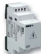
Coupling device RL 5898