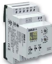
Insulation monitor RN 5897