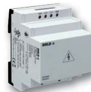
Coupling device RP 5898