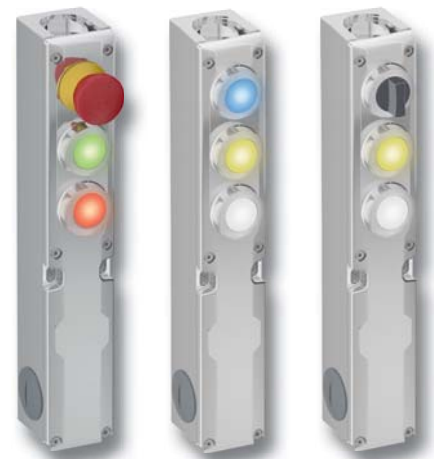
Option module TTN / TTT / TTW