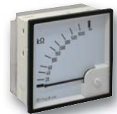
Indicating instrument RP 5898