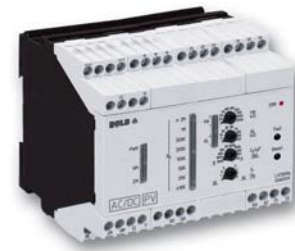
Insulation monitor LK 5896