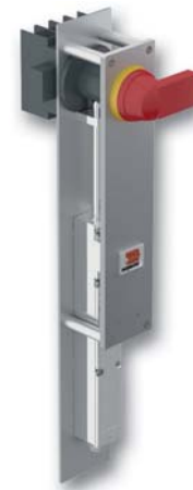
SAFEMASTER STS Power Interlocking ZRH01SLPR40