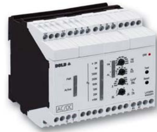
Insulation monitor LK 5894