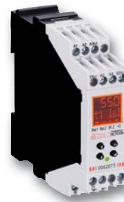
Multifunction timer MK 7830N