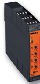
Softstarter UG 9019